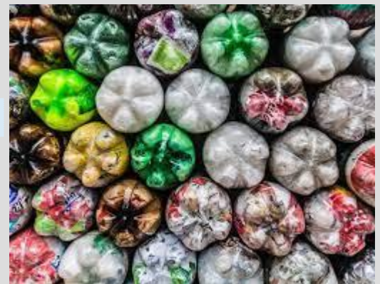
Eco bricks made from waste material

with clean, dry plastic Over 300+ eco bricks have already been made by FIS students and delivered to Kasane from which point they are distributed to areas where these plastic bricks are used to build school structures in rural areas. These eco bricks will be used to build a structure in the school.