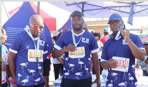
Team Botash showing off their medals.

Team Botash participated at the 2023 FNB Kazungula Bridge Marathon (KBM) that took place on the 25 th of February.