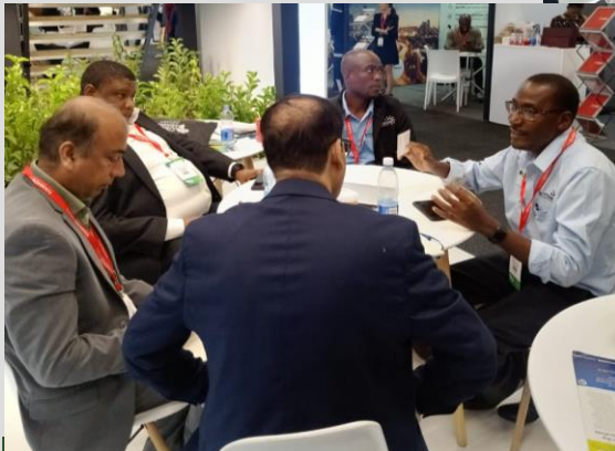
Indaba on lens