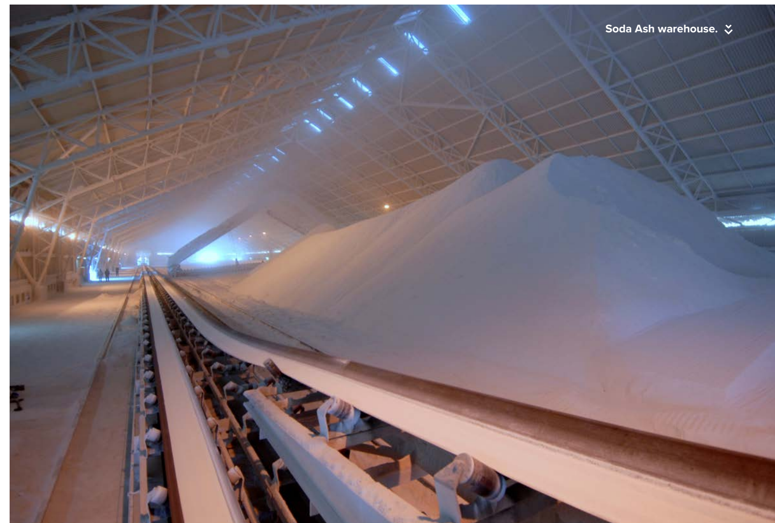
Soda Ash warehouse. ▾

The most recent challenge, unsurprisingly, has been the