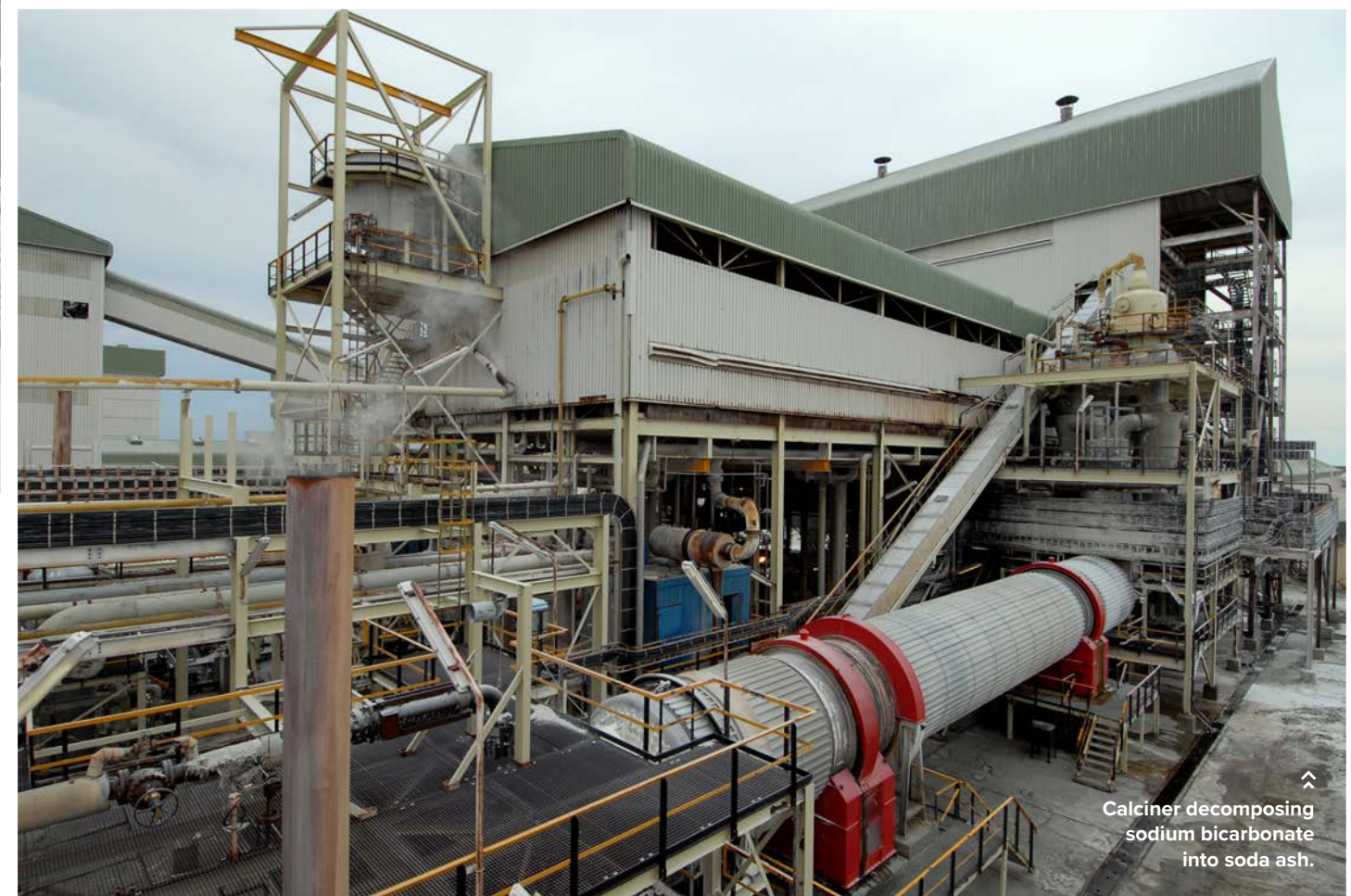
Calciner decomposing sodium bicarbonate into soda ash.

“We bring significant value to this part of the country and the entire economy. Our vision is to be a market leader in the production and supply of high-quality natural sodium and related products, continuing to be one of the flagship enterprises of Botswana's growing economy,” he concludes. ☺