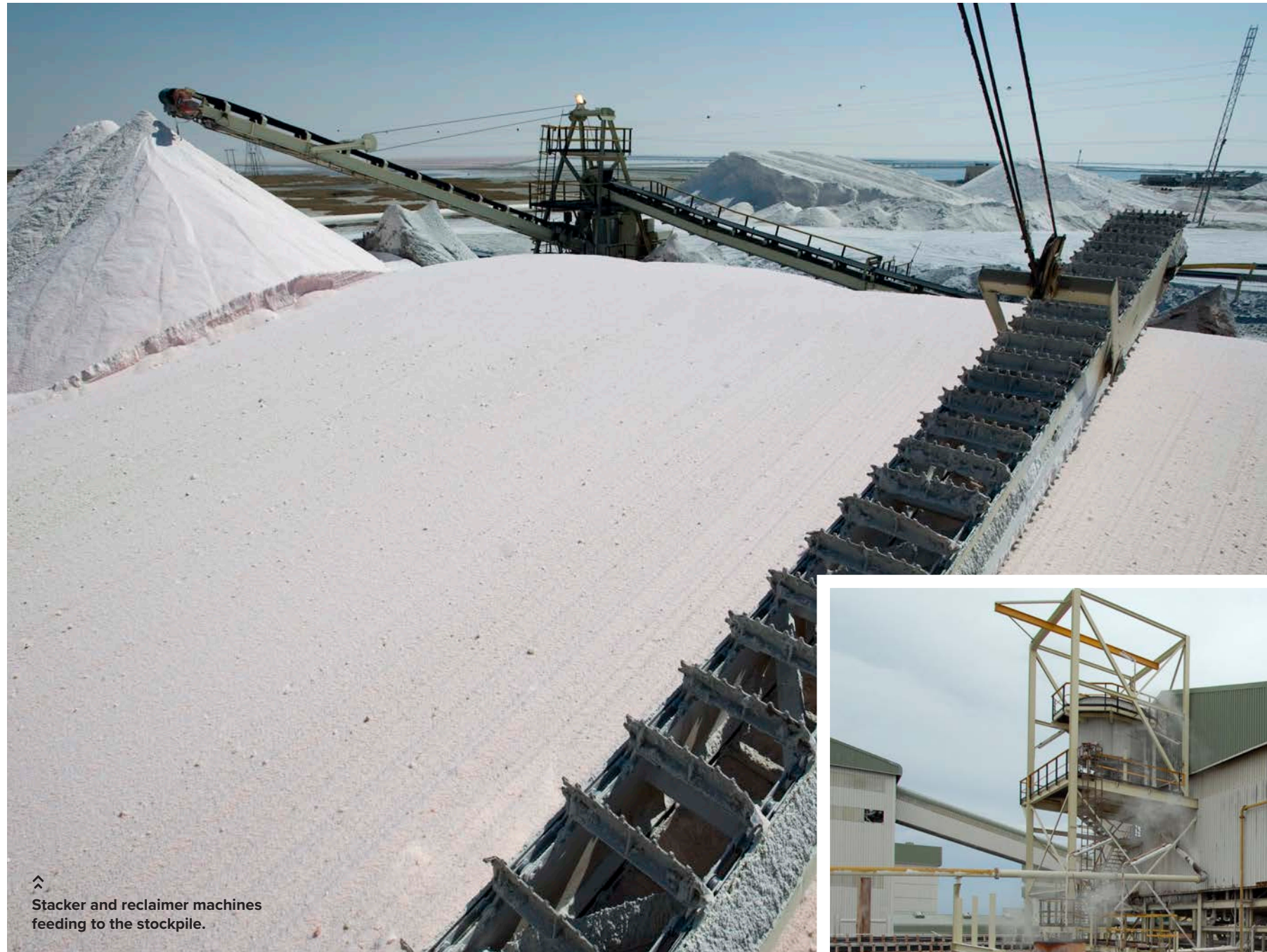
Stacker and reclaimer machines feeding to the stockpile.

Botash also acts to ensure that effluents are carefully contained and impounded so that contaminants do not enter