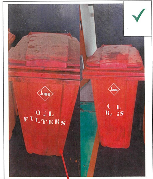
Oily rags and filters should be disposed in red waste bins provided