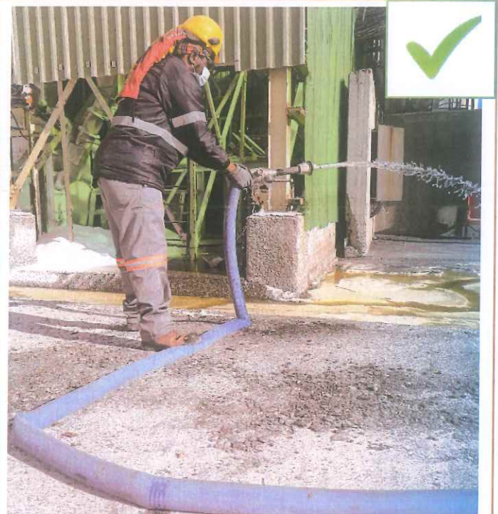
Hoses used for washing the plant structures- Coloured green/blue